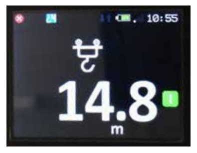
Hoisting and operation indicator