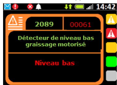
Example: default description

< Jib radius and capacity information. White text: current values. Blue text: maximum values. Example: at 26,1 m, the crane can lift up to 1,7 t / the 980 kg load can be trolleyed to 40 m radius.